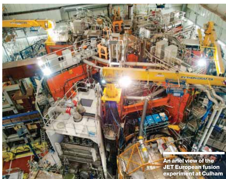
An aerial view of the JET European fusion experiment at Culham

that power the sun. We are fusing atoms together, resulting in a huge release of energy, which we