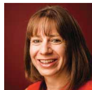
Dawn Bonfield Women's Engineering Society

“Thankfully we have a new generation of amazing young female role models coming through, and we need to ensure that we promote and continue to employ these women up to and beyond the inevitable maternity break through retraining”