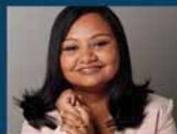
DR SNEHA MALDE UNIVERSITY OF OXFORD 'Searching for New Physics through measuring the differences between matter and anti-matter'