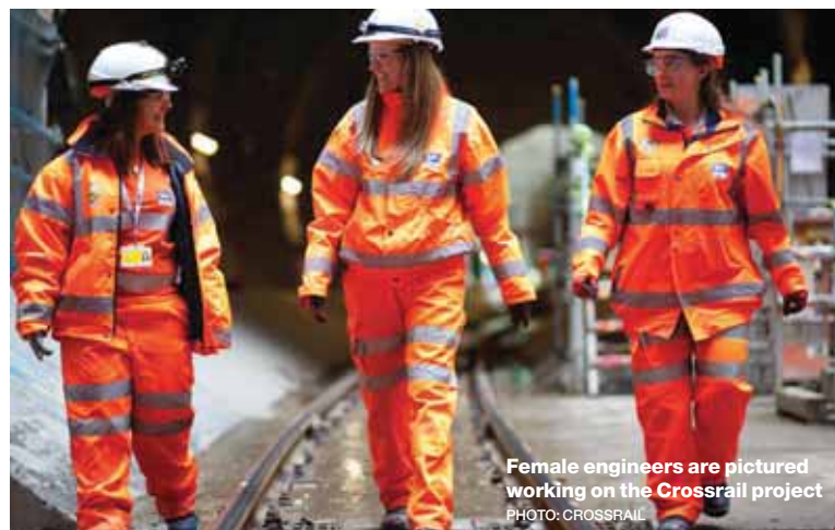
Female engineers are pictured working on the Crossrail project

to the Construction Industry Strategy Advisory Council, shaping Government's construction policy. She has even found time to author text books, is an editorial advisor for Project Management World and judges the Wolfson Economics Prize.