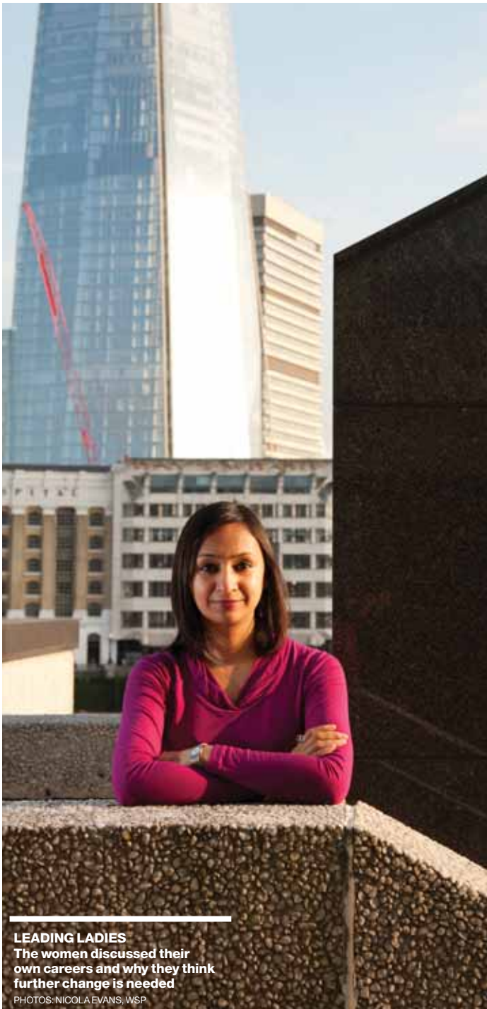
LEADING LADIES The women discussed their own careers and why they think further change is needed

HK: Industry, Government and Education need to work together to do everything we can to promote the study of STEM subjects. I am involved in Fluor's schools outreach programme which includes running an annual engineering competition for local secondary